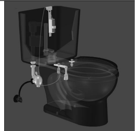
TG 1000 Complete Installation With Bowl Overflow Elimination and Water Conservation sensors